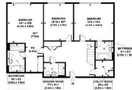
SEVENTH FLOOR GROSS INTERNAL FLOOR AREA 989 SQ FT

APPROX. GROSS INTERNAL FLOOR AREA 1618 SQ FT / 149 SQ M N.G.M. - 1001 Copyright 2015 P.A.A. 05-08 Floor plans are for identification and guidance purposes only, not to scale. Compliant with BS5 code of measuring practice.